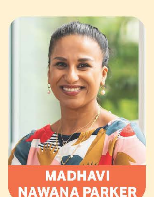
BEING CALM IN THE EYE OF A PARENTING STORM